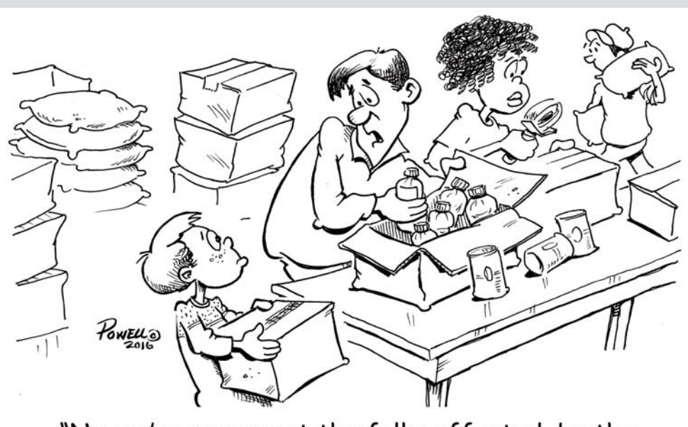
"No, we've never met the folks affected by the hurricane, but whoever they are, they're family!"